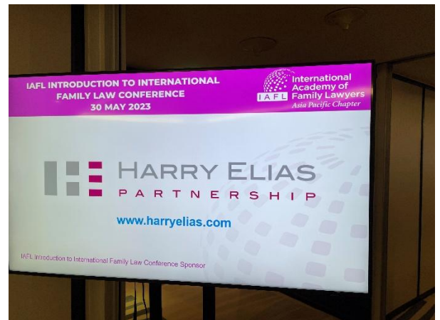
Session branding, Bangkok 2023