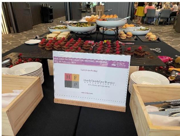
Refreshment break branding, Brisbane 2024