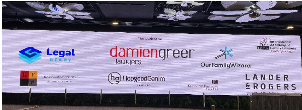
Sponsor branding outside the hotel, Brisbane, February 2024